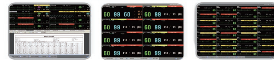
Wave Review and Print Preview Large Font Display 32 Beds Display