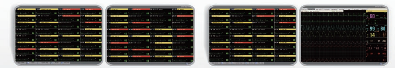
64 Beds Display Single Bed View