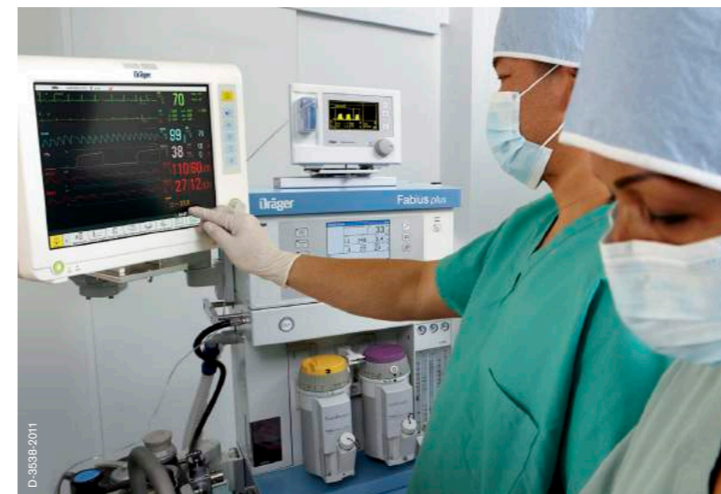
OR: Vista 120 monitor, Fabius® plus anesthesia machine and Vamos anesthetic gas monitor