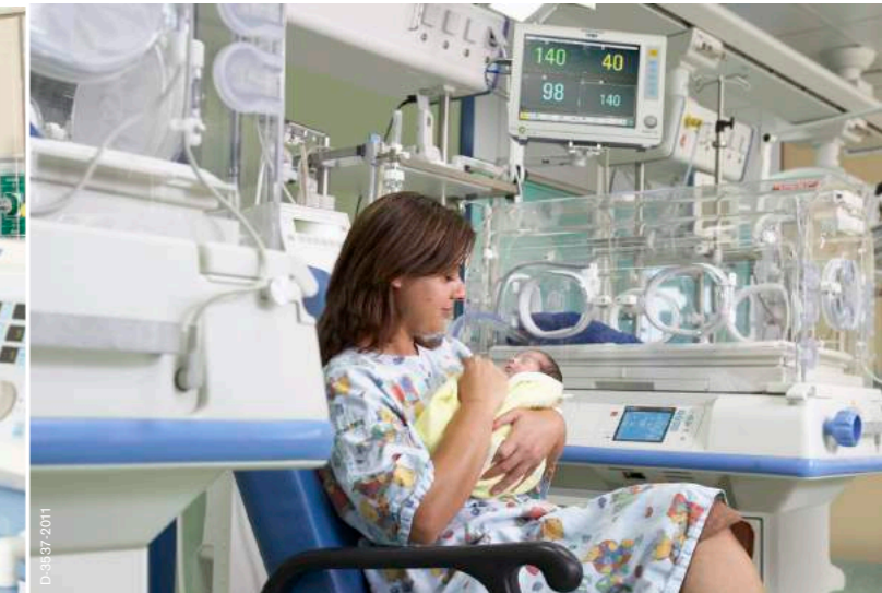
NICU: Vista 120 monitor, Isolette® C2000 incubator and BabyLog® 8000 ventilator